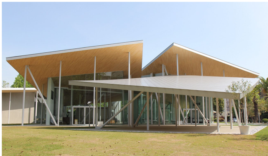
「Junko Fukutake Hall」 Kazuyo Sejima + Ryue Nishizawa / SANAA Okayama University (Shikata Campus, Okayama City) http://www.okayama-u.ac.jp/eng/access_maps/index.html