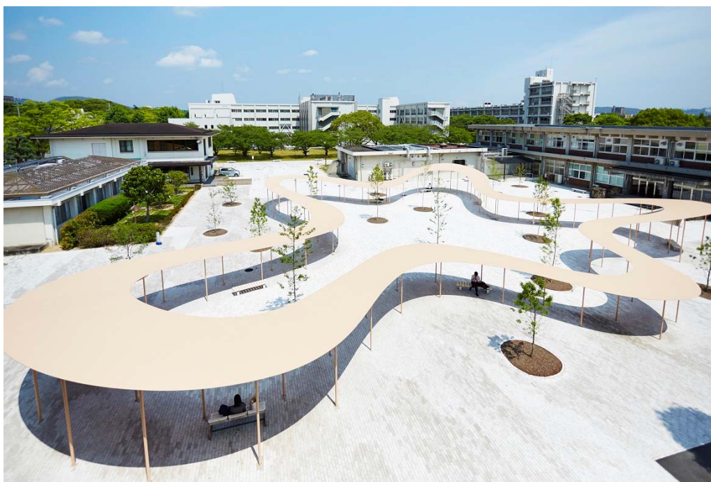
Okayama University (Tsushima Campus, Okayama City)

http://www.okayama-u.ac.jp/eng/access_maps/Tsushima_Campus.html