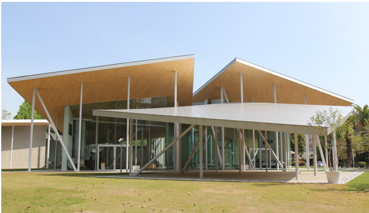
「Junko Fukutake Hall」 Kazuyo Sejima + Ryue Nishizawa / SANAA Okayama University (Shikata Campus, Okayama City) http://www.okayama-u.ac.jp/eng/access_maps/index.html

Okayama University supports the Sustainable Development Goals