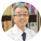
Director, Department of Oral Diagnosis and Dentomaxillofacial Radiology