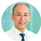
Director, Department of Comprehensive Dentistry