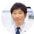
Director, Department of Oral and Maxillofacial Surgery