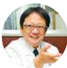
Director, Department of Orthopaedic Surgery