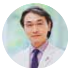
Director, Department of General Medicine