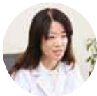
Director, Department of Pediatric Dentistry