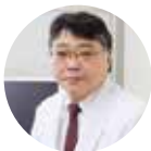
Director, Department of Oral and Maxillofacial Reconstructive Surgery