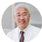
Director, Department of Anesthesiology and Resuscitology