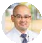
Director, Department of Otolaryngology-Head and Neck Surgery