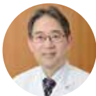
Director, Department of Dental Anesthesiology