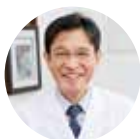
Director, Department of Orthodontics