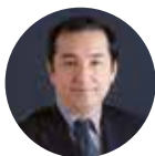
Director, Department of Oral Rehabilitation and Implantology