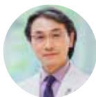
Director, Department of Infectious Diseases