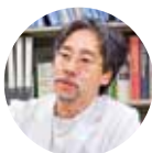
Director, Plastic Surgery Department