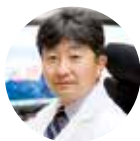
Director, Department of Pediatric Cardiovascular Surgery