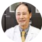
Director, Pediatric Surgery Department