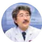
Director, Department of Periodontics and Endodontics