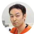
Deputy Director, Department of Infectious Diseases