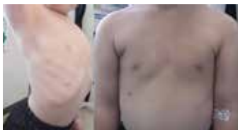
Scars are inconspicuous under the armpit, making them aesthetically pleasing.

We perform minimally invasive cardiac surgery for relatively simple cases with congenital heart disease. The surgery is performed through a small skin incision below the right axilla (armpit), and unlike most of the cardiac surgery that opens the