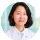
Director, Department of Child Psychosomatic Medicine