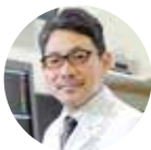
Director, Pediatric Radiology Department