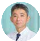
Director, Department of Neuropsychiatry