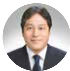
Director, Department of Neurology and Strokology